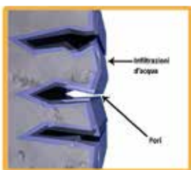
Microporosity of an untreated surface subjected to infiltration of water and dirt.

THIS IS A UNIQUE SYSTEM BECAUSE IT LEAVES THE BREATHABILITY OF POROUS MATERIALS UNCHANGED WHILE PROTECTING THEM